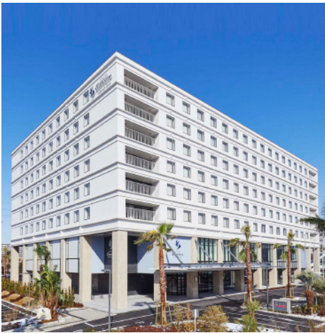
Hotel (Emion Square)