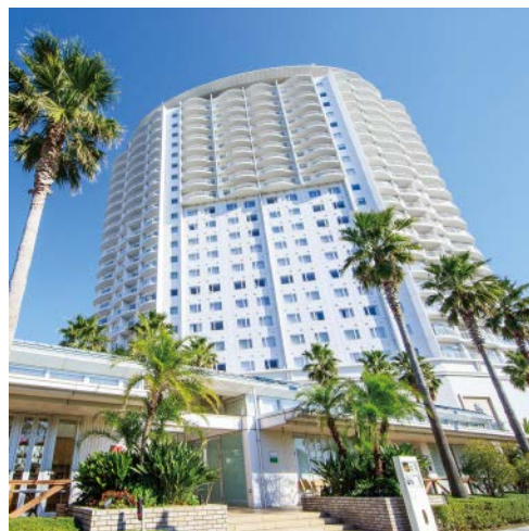
Hotel (Emion Tower)