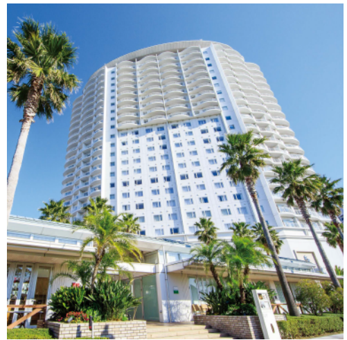
Hotel (Emion Tower)