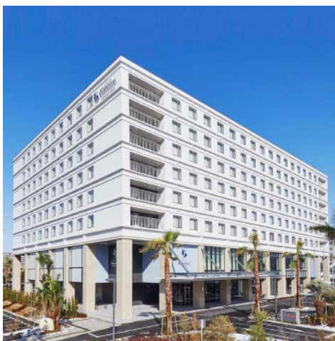
Hotel (Emion Square)